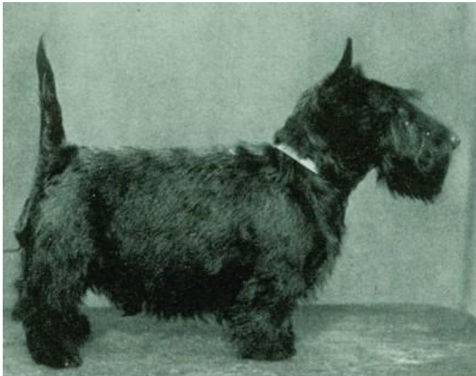
Ch Heather Necessity, the only previous Scottish Terrier to win BIS at Crufts.

It had been 86 years since a Scottish Terrier last won best in show at Crufts, but the two animals are directly connected in the tail male line.